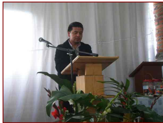
Meeting with the new church in Cheran.

interested in reformed theology, and is exploring the possibility of joining with our churches in Paracho and Cheranastico to form a Tarascan Presbytery. Please join us in prayer for this fledgling congregation and its leaders, that the Lord will bless their kingdom efforts there in Cheran, and that